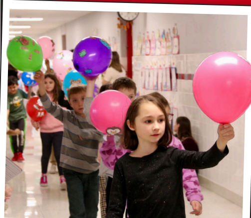
Second Graders Created Their Own "Balloons Over Broadway" Parade!