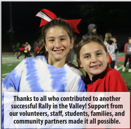
Thanks to all who contributed to another successful Rally in the Valley! Support from our volunteers, staff, students, families, and community partners made it all possible.

Scan the QR code to view more highlights!