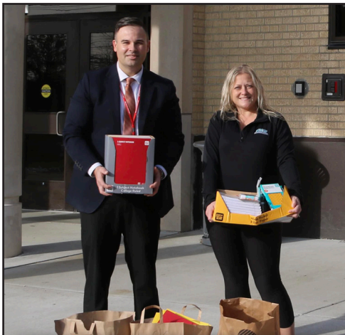
We're grateful to the Nimmonsburg-Hillcrest Rotary for providing school supplies for CV students!

Contact your school's social worker or the CV Middle/High School Guidance Office at 607-762-6918. All inquiries are confidential.