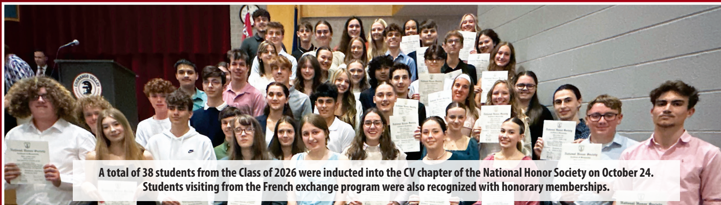
A total of 38 students from the Class of 2026 were inducted into the CV chapter of the National Honor Society on October 24. Students visiting from the French exchange program were also recognized with honorary memberships.