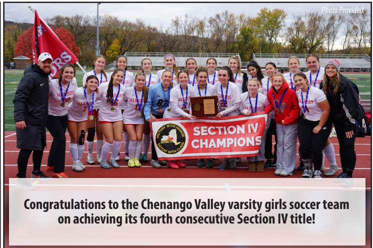
Congratulations to the Chenango Valley varsity girls soccer team on achieving its fourth consecutive Section IV title!