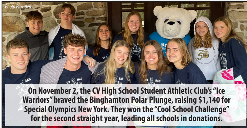
On November 2, the CV High School Student Athletic Club's "Ice Warriors" braved the Binghamton Polar Plunge, raising $1,140 for Special Olympics New York. They won the "Cool School Challenge" for the second straight year, leading all schools in donations.