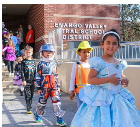
Halloween Brought Out Creative Learning and Fun!