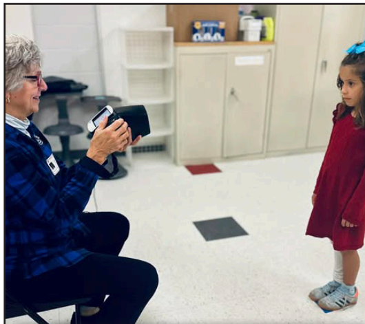
The Binghamton Lions Club once again supported annual vision screenings at PDE through their "Lions SEE" program!